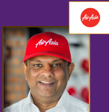
Tan Sri Tony Fernandes CEO, AirAsia Group